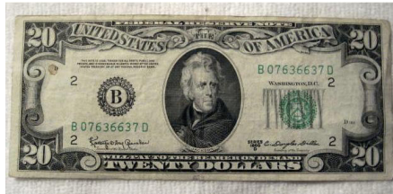
This is not money - it is a privately owned "FEDERAL RESERVE NOTE"

The Corporate U.S.. Government provides, or at best pretends to provide for this reservation of rights under the Uniform Commercial Code (UCC) 1-207 and 1-103. You need more information in this area. It is not in the best interest of the United States Corporate "PUBLIC" schools to teach you about their bankruptcy proceedings and how they have set the snare to Compel you into paying their debt. The Corporate "PUBLIC" schools are strictly designed for their Corporate citizen/subjects. That is the Corporate U.S.. Public School citizens.