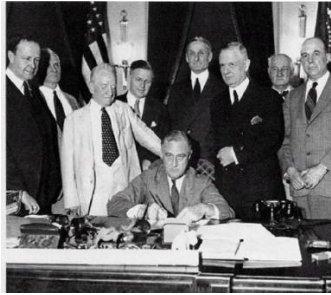
FDR confiscated the people's gold in 1933

you try to look up the 1930 minutes, you will not find them because they don't publish this particular volume. If you try to find the 1930 volume which contains the minutes of what happened, you will probably not find it. This volume has been pulled out of circulation or is hidden in the library and is very hard to find. This volume contains the evidence of the bankruptcy.