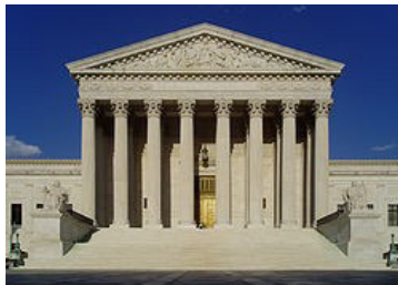
The US Supreme Court

The members of the Supreme Court, of course, realized what was happening to them and the system of law. The court was being asked to perform in a creditor, debtor bankrupt proceeding to the benefit of the