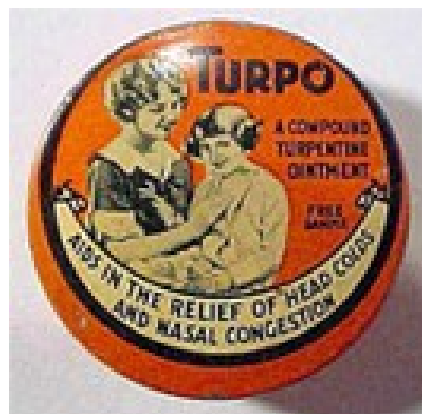
Glessner Company Turpo Free Sample Ointment Tin

In short the \alpha - and \beta -pinenes eliminate many bacteria and fungi. Turpentine also looks very promising in eliminating Candida , a yeast organism that apparently is found in most people.