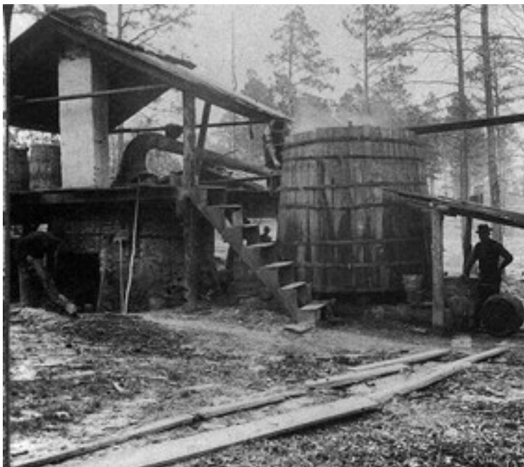
Distilling turpentine from the crude resin in the pine forests of North Carolina 1903 ( DaysGoneBy )

There is a very nice article about the history of turpentine harvest and distillery at the DaysGoneBy website with a lot of old pictures.