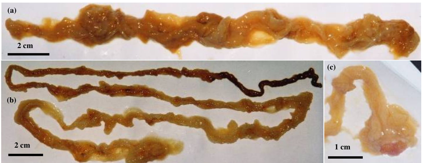
Fig. 1. (a) Anaerobic human intestinal "rope" parasite; (b) Fully developed adult intestinal parasite with the suction head; (c) Close-up view of the suction cup head.

Unlike others, these parasites do not have muscles, nervous system, or distinct reproductive organs, etc., and dry out quickly when exposed to air. The main reason these parasites have not been previously discovered by the researchers, is because they rarely come out as whole fully developed adult species. They also look like human excrements (Fig. 1(a)), and don't move outside the human body in air. These parasites are often mistaken for decaying remains of other parasites, feces, or lining of the intestines, as their colour varies from white to brown, to dark grey. Fig. 1(b) shows over a meter long adult intestinal parasites, which resembles a rope. Thus, the adult stage of these parasites is named "rope" parasites. Rope parasites can leave human body with special enemas, 5-8 which is how they have been discovered.